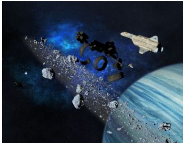
Relic Hunt in a Basalt Rock Belt