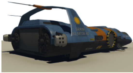
Views from above...