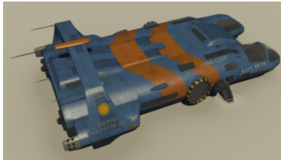
The personnel airlock and landing gear...