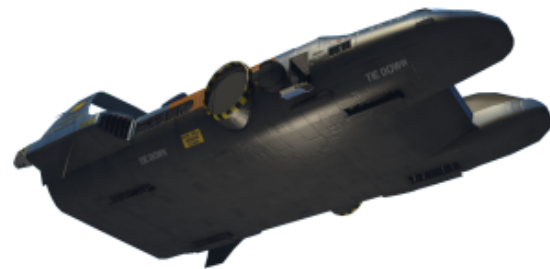
Marava with airlock open and gear up / airlock open and gear down