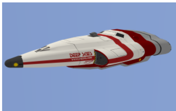
Star-Class Armored Merchant